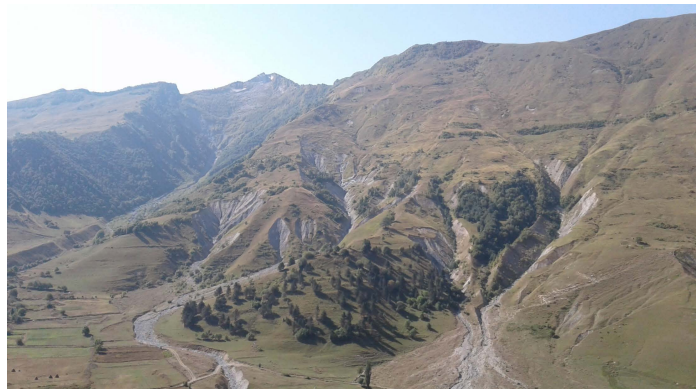
Mountain tops with grasslands and meadows in Mtskheta province, Georgia.