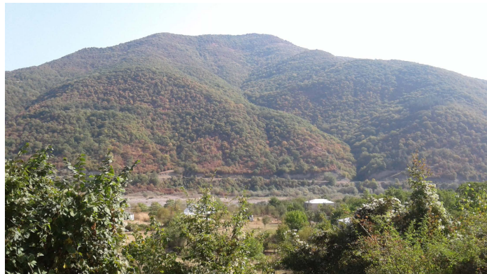
Foothills of Mtskheta, Georgia, with beech, oak, and pine forest in the lower foothills.

The Scientific-Research Center of Agriculture (SRCA) organized an optional field visit for participants to see LCLUC in the mountain landscapes of the Mtskheta–Mtianeti region in Georgia. Mtskheta is the ancient capital of Georgia located 20 km (~12 mi) north of Tbilisi at the confluence of the Aragvi and Mtkvari rivers. There are Oriental hornbeam, oak, and pine forest in the lower foothills, located 500–600 m (~1640–1970 ft) above sea level [ top photo ]; and grasslands and meadows on the mountain tops, located at elevations higher than 2000 m (~6560 ft) [ bottom photo ]. The mountain landscapes are undergoing rapid changes due to urbanization and tourism. Along the way, participants visited the Research Station of SRCA, run by the Georgian Ministry of Agriculture, which focuses on research and development of native, annual, and perennial crops germplasms. A Georgian grapevine germplasm center has been in operation at SRCA since 2009, comprising 437 Georgian native grapevine varieties which are kept as collections. In addition, 150 varieties of wheat, 250 varieties of maize, and different spices, fruits, and legume germplasm varieties are preserved at the Center.