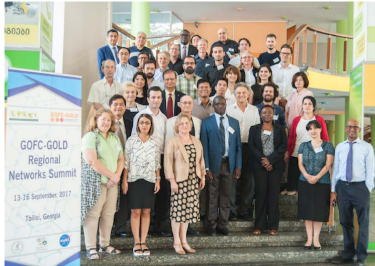
GOFC–GOLD Twentieth Anniversary meeting participants.

The GOFC–GOLD program celebrated its twentieth anniversary by convening a Regional Network Summit in Tbilisi, the capital of the country Georgia,